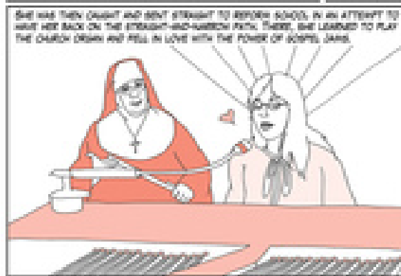
SHE WAS THEN CALLED AND SENT STRAIGHT TO REFORM SCHOOL, IN AN ATTEMPT TO BRING HER BACK ON THE STREET-AND-SCHOOL PARK. THERE, SHE LEARNED TO PLAY THE CHURCH ORGAN AND MET AN LOVE WITH THE POWER OF SCIENTS, JAMES.