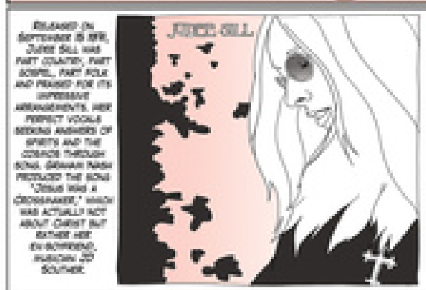
RELEASED IN SEPTEMBER OF 1970, JUDGE SILL WAS FIRST CALLED, FIRST SONGS, FIRST HOUR AND PRINCE FOR ITS IMPASSIVE ARRANGEMENTS, HER PERFECT VOICES BRINGING ANOTHER OF SPIRITS AND THE COUNTRY THROUGH SONGS. (SHE WROTE) PRODUCED THE SONG 'GODS LIKE A CROCODILE,' WHICH WAS ACTUALLY NOT ABOUT GODS BUT ABOUT HER EX-BUSINESSMAN, HUSBAND OF SOUTHERN.