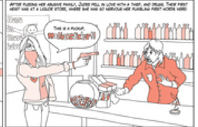
AFTER WRITING HER FAMOUS SONGS, JUDGE SILL BECAME A THIEF, AND WROTE. SHE FIRST MET HER AT A RECORD STORE, WHERE SHE WAS SO NERVOUS HER FAVORITE SONGS WERE!