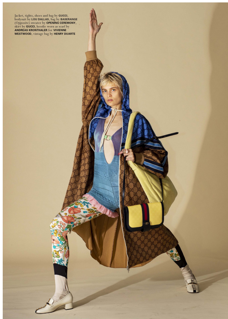
Jacket, tights, shoes and bag by GUCCI. bodysuit by LOU DALLAS, bag by BASERANGE. (Opposite) sweater by OPENING CEREMONY. skirt by GUCCI, hoodie worn as scarf by ANDREAS KRONTHALER for VIVIENNE WESTWOOD, vintage bag by HENRY DUARTE