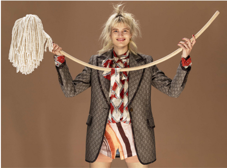
Shirt and jacket by GUCCI , shorts by NIKE , shoes by TAWAN KBH