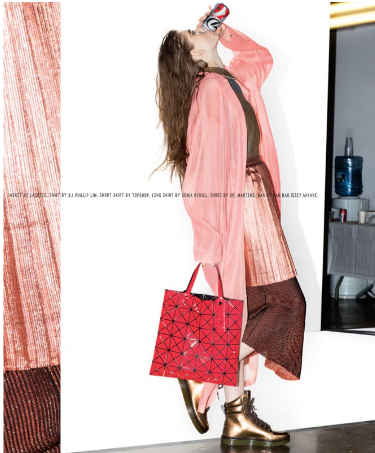
JACKET BY LACOSTE, SHIRT BY 3.1 PHILLIP LIM, SHORT SKIRT BY TOPSHOP, LONG SKIRT BY SONIA RYKIEL, SHOES BY DR. MARTENS, BAG BY HAO BAO, ISSEY MIYAKE.