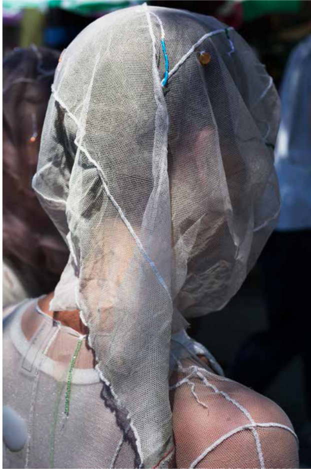
Hand-beaded veil and jacket SAG, bra RYOHEI